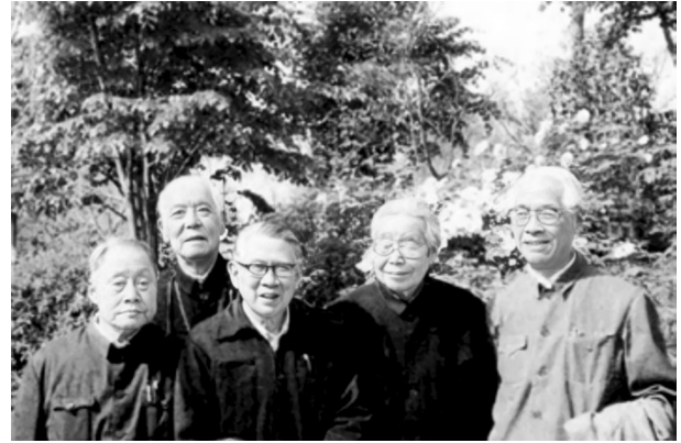
Figure 7. In 1990, Te-Pei Feng (first from the right) and Hsiangtung Chang (second from the right) visited the Shanghai Botanical Garden.

of Academia Sinica. Following the foundation of People's Republic of China in 1949, Feng held multiple posts, and also made great strides in the study of peripheral nerves, central nerves and muscles (Fan, 2007). Feng was selected as a member of the Chinese Academy of Science in 1955 (Academician of People's Republic of China) (Fig. 6). The following year, Feng went to Copenhagen and invited Hsiangtung Chang (张香桐) back to China to establish a