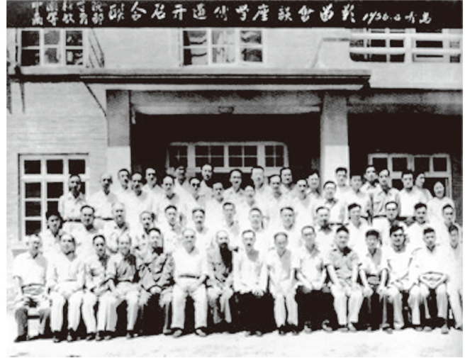
Figure 4. The Qingdao Meeting on Genetics in August 1956.