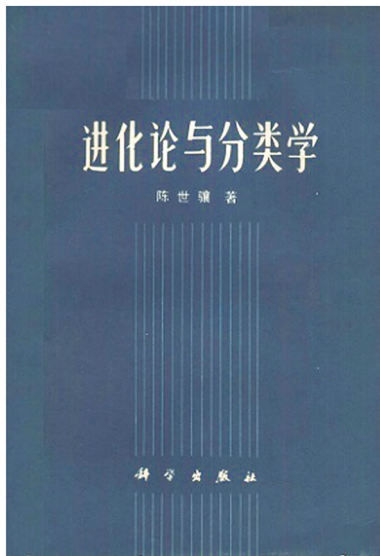
Figure 5. Evolution and Taxonomy , by Sicien H. Chen in 1978.