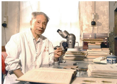
Figure 1. Sicien H. Chen (1905–1988).