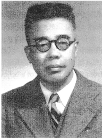
Figure 1. Tsang Yu-Chuan in 1954.

attentional process; “complex behaviors are naturally organized from simple reactions that are often not immediately connected to a higher-level combination. They combine slowly, which is the process of consciousness” (Tsang, 1924, p. 11).