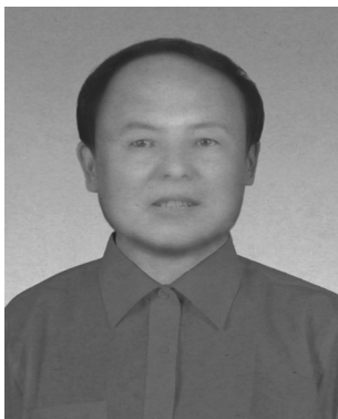
Figure 1. Professor Haowen Xu.

the development of boys' exercise capacity, which promoted further secretion of androgenic hormones. In contrast, the level of androgenic hormone remained basically unchanged in girls as they entered adolescence, which helped to explain differences in exercise capacity between adolescent boys and girls. This important revelation laid the theoretical foundation for different gender groups participating in different forms of physical exercise (Xu, 1986). Since the 1990s, there has been a fervent belief that participating in sports could delay human aging and decrease causes of increased morbidity, such as tumors. In an attempt to rectify this one-sided view, Prof. Xu released a paper entitled Rehabilitation and Immunity of Geriatric Diseases , and made the point that excessive exercise could lead to unfavorable consequences, such as increasing the incidence of infection, enhancing the sensitivity of tumor onset, or aggravating a disease's course. Therefore, he proposed that people should choose reasonable exercises according to their personal situation (Xu, 1993).