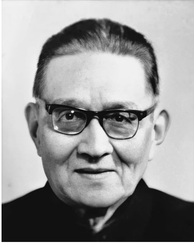
Figure 1. Chi-Nan Hu (1905–1989).