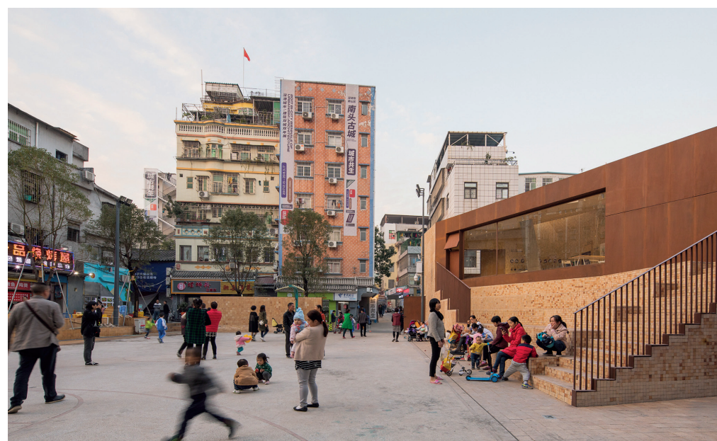
3. 古城展区一瞥 3. A glance at the exhibition area of Nantou old town

This Biennale offers us a new lens to examine the current urban development patterns in China and to explore alternatives. Hopefully, nowadays new