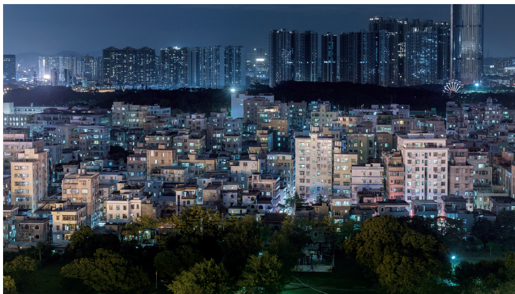
2. 南头古城夜景 2. Night scene of Nantou old town