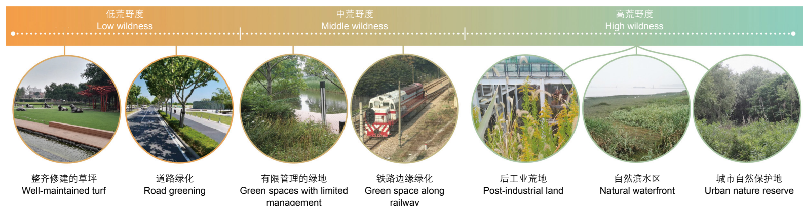
1. 城市自然空间荒野度量表 1. The wildness gradient of urban natural spaces

中识别城市荒野景观的有效方式（图1）。阿克·穆勒等人 [61] 提出了量化荒野度的4项指标：1）地表覆盖植被的自然程度；2）是否具有特殊地形；3）偏远程度（可以借由城市交通噪声水平衡量）；4）人工构筑的可见度。