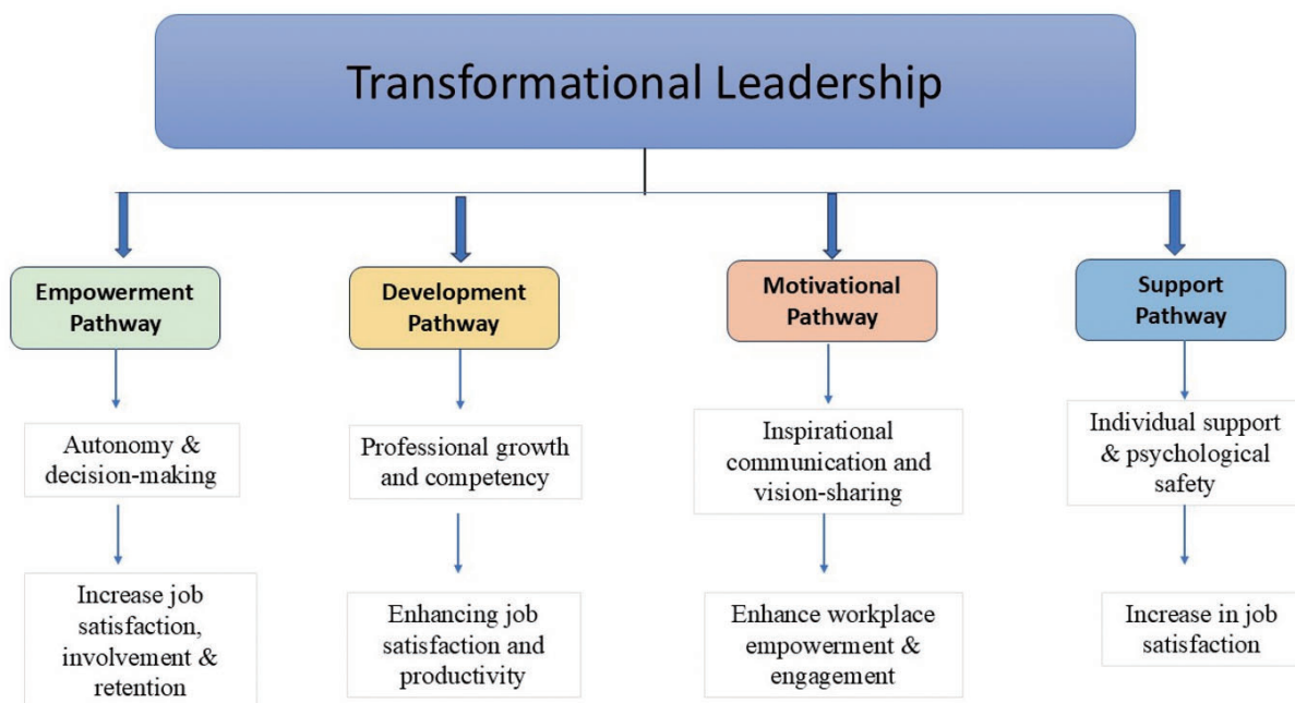
Figure 2. Conceptual framework: Pathways linking transformational leadership to nurse job satisfaction and productivity

3) Motivational pathway: Inspirational communication and vision-sharing represent core transformational leadership behaviors that drive superior outcomes. Transformational leadership inspires followers to surpass their expectations by reshaping their emotions, values, and objectives to improve the success and performance of the organization. [7, 35] Transformational leaders cultivate a collective vision, empower their team members, and enhance workplace empowerment, resulting in increased job satisfaction among nurses. [31] Recent research indicates that transformational leadership styles motivate nurses to surpass expectations, which leads to enhanced patient outcomes, organizational commitment, and job satisfaction. [11, 40]