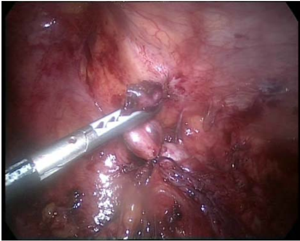
Fig. 3 Long stump remnant appendix which was ligated and removed.

specific to any peculiar condition. Ilio-psoas abscess was clearly identified after performing the abdominal radiological studies for the patient. Furthermore, the patient was found to be free of tuberculosis, without obvious medical condition that can cause ilio-psoas abscess. This, together with failed conservative management, compelled us to search for unusual cause of ilio-psoas abscess, and hence laparoscopic exploration was done.