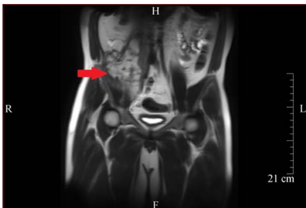
Fig. 1 MRI demonstrates a 19 cm × 3 cm × 7 cm fluid collection (arrow) extending along the right psoas muscle with extension into the upper right iliacus muscle

The clinical presentation of our patient was non-