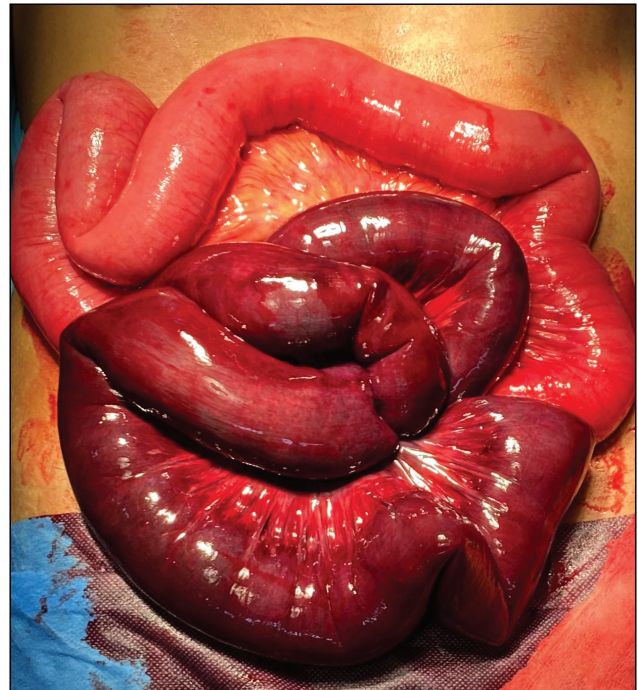
Figure 2: Intraoperative findings

Blood tests revealed an increase in white blood cells of 12,500/\text{mm}^3 , otherwise the rest was unremarkable.