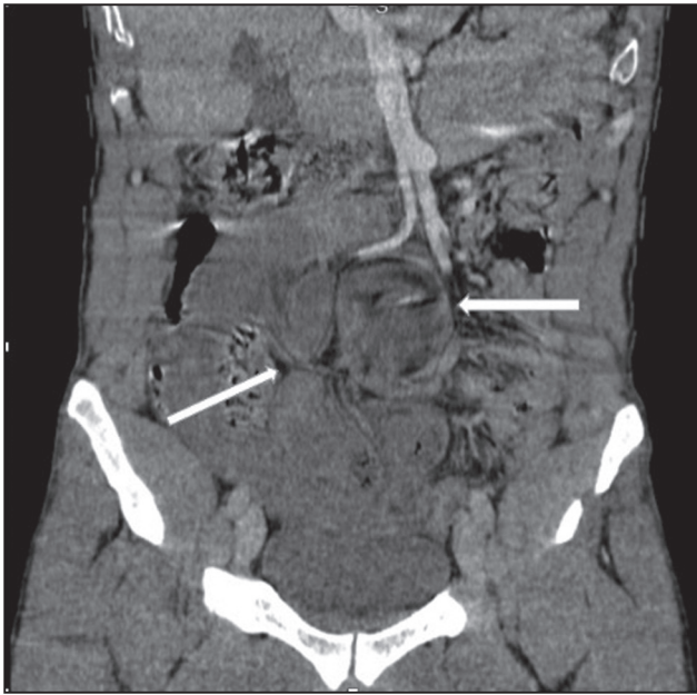
Figure 1: Contrast-enhanced coronal computed tomography scan image that shows multiple bowel loops and a bird's beak appearance in the paracecal region