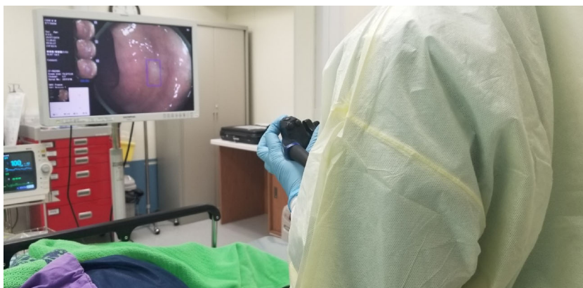
Fig. 1 AI-assisted colonoscopy is already used in daily clinical practice to find polyps.

Endoscopic assessment of depth of cancer invasion by AI-assisted programs is also starting to produce promising results. Tokai et al. used white light imaging and narrow-band imaging endoscopic picture to train the machine in differentiating superficial versus deep invasion of squamous cell carcinoma of the esophagus [15]. Their results showed that the CNN system can diagnose, within seconds, the invasion depth of esophageal cancers with accuracy of around 80%. The differentiation between malignant and non-malignant tissue has found another therapeutic application. By accurately defining the margin of endoscopic resection, Ichimasa et al. claimed that AI-assisted endoscopy will indicate the need for additional surgery after endoscopic resection of early colorectal cancers [16]. These studies, if validated, will greatly reduce the need for operative surgery in early cancers.