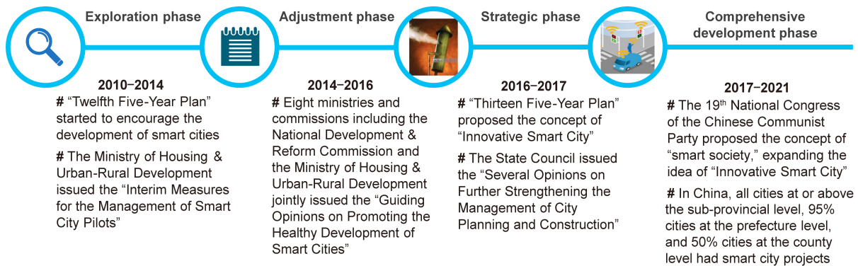
Fig. 2 The four phases of smart city construction in China

development of smart cities. In 2012, the Ministry of Housing and Urban-Rural Development issued its “Interim Measures for the Management of Smart City Pilots,” in which the first and second batches of pilot cities (numbering 90 and 103, respectively) were selected (Kang and Wang, 2018). Longgang of Shenzhen was selected in the first batch, and a smart city operation and management center was established. The authors visited the Longgang Smart Center twice. The staff explained that the air, water, hill-side slopes, fire facilities, roads, houses, streetlights, cameras, manhole covers, and other infrastructure in the pilot zone were all equipped with sensors and computing units. Data collected by these sensors is processed and analyzed at the center, and then an overall picture of Longgang is obtained, including its joint command under emergency conditions and its big data decision-making support. All of these can be viewed on a high-quality 168 m 2 LED screen, which is currently China’s biggest indoor LED screen with the largest curvature and the highest resolution (Fig. 3). The city was no longer an agglomeration of cold hardware (steel bars, water pipes, roads, and wires), but an intelligent body of information with an inherent sensing and computing cycle: perception, connection, computing, and intelligence.