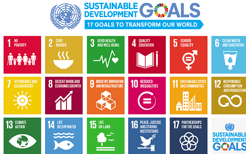
Fig. 5 The sustainable development goals of the United Nations (United Nations, 2015)

government departments. Now, however, increasing numbers of individuals, groups, and companies are using the newly available data created by the information technology empowerment layer to develop smart applications and new business models, which link a city's functional units with its citizens. Interestingly, in most cases, it is not done by the owners of the infrastructure, but rather by visionaries and entrepreneurs, whose new applications affect traditional service providers. The ride-sharing platform Didi, for example, does not own the means of production or infrastructure it uses. Although the platform's success did lead to strikes and complaints from traditional taxi drivers, it did not affect Didi's rapid rise.