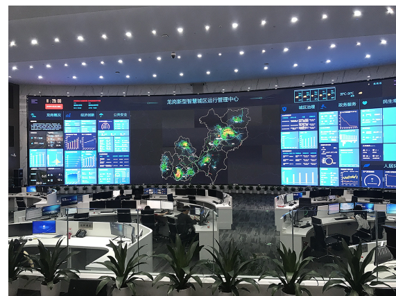
Fig. 3 The LED screen at the Longgang Smart Center

The second phase of China’s smart city development took place between 2014 and the beginning of 2016, and saw the strengthening of coordination between the country’s ministries and commissions, aiming to regulate the disorderly development of smart cities in the first stage. In August 2014, eight ministries and commissions, including the National Development and Reform Commission and the Ministry