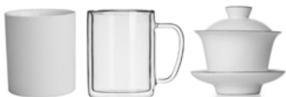
Fig. 1 Children aged three or four can recognize and use different cups, but may not be able to describe these objects in language

Cognitive psychology studies show that human memory stores much more visual knowledge than language knowledge. Visual knowledge has been classified as common sense because it is difficult to express in language symbols. For instance, before the age of five, children who see different cups may grab them in different ways to drink water, which proves that they are proficient in the application of visual knowledge, although they may not yet be able to explain their actions in words (Fig. 1). What people learn in their early childhood is mostly visual knowledge.