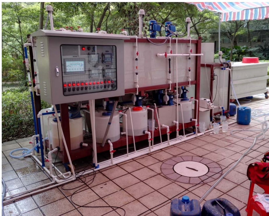
Fig. S1 Pilot plant for Tl removal from Zn oxide production industrial wastewater