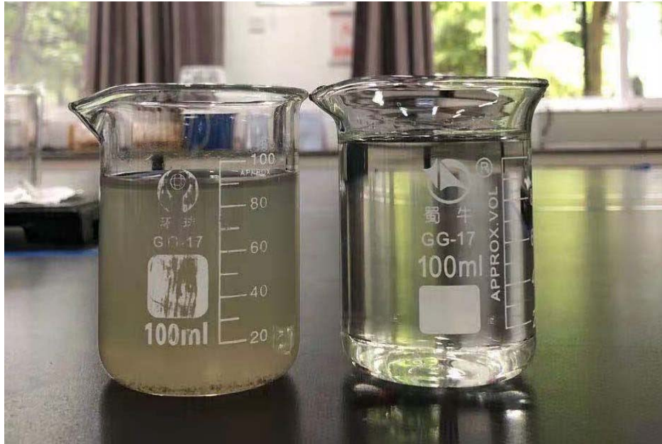
Fig. S3 The photo of influent and effluent sample of HBR reactor