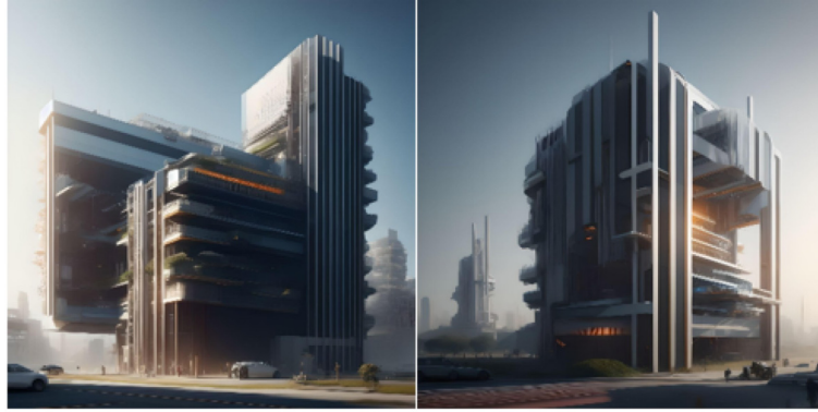
Fig. 3 AI-generated engineering building display drawings.

of engineering design, alongside exemplary engineering design cases. This corpus of knowledge can be synthesized into textual materials suitable for GPT-based learning, including domains such as engineering project construction, building materials, and building technology. In this context, AIGC assumes the role of a design and scheme rendering assistant. During the design model generation phase, AIGC articulates building model requirements in natural language and promptly generates Building Information Modeling models amenable to collaborative work by multiple stakeholders. In the design rendering phase, AIGC adjusts design criteria based on parameters and natural language inputs, intelligently generating design-inspired solutions and renderings.