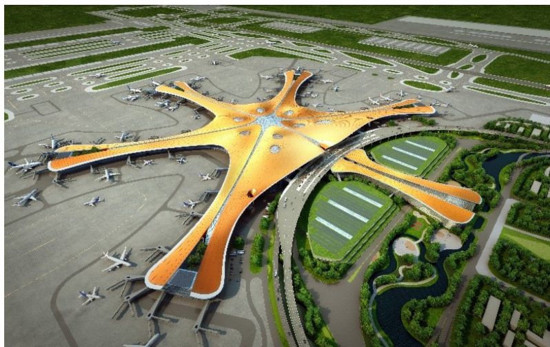
Fig. 1 Aerial view of Beijing Daxing International Airport Terminal.