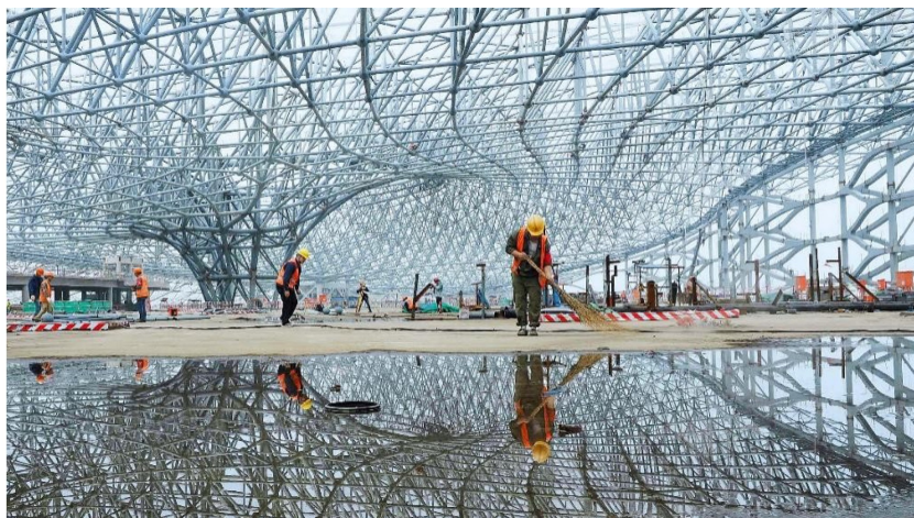
Fig. 2 Actual picture of steel structure roof truss construction.