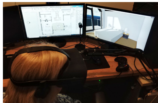
Fig. 6 Participant making changes within the VR