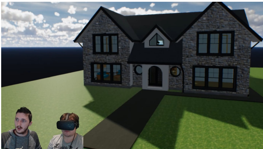
Fig. 2 Revit model immersed in VR

The results of changes within the rooms done live through Revit were obtained from the recorded videos to check whether the B/Q schedule would correctly add up new costs and remove them when appropriate. This step enabled a B/Q to be generated based on changes the client made to the model, as seen in Fig. 5. The connection between the client understanding the idea within the headset and the architect demonstrating changes live within that test improved their relationship, as seen in Fig. 6. The recordings demonstrate that the prototype works and provides a number of benefits, such as B/Q accuracy and the clients' approval at various stages, such as feasibility. In terms of contractor costs, the B/Q provided by the prototype could be used to obtain an accurate final cost for the proposed build. A cost breakdown where the corresponding schedules highlight each room separately and generate an overall cost per room can be generated. This feature can be made more manageable for clients or contractors to foresee overpayments within each of the rooms. Instead, the contractor valuing the B/Q of the approved warrant drawings and providing an estimated value of works can address the B/Q schedules that can be provided to the contractor with fixed price of each component.