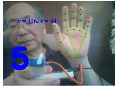
Figure 2 21 red points indicating hand landmarks.

the index finger can change the angle of a servomotor. Figure 2 shows a screenshot of demonstration of fservo.py .