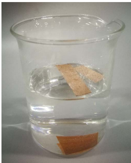
Fig. S1. Samples immersing in acidic solution (HCl, pH = 3) after 24 h