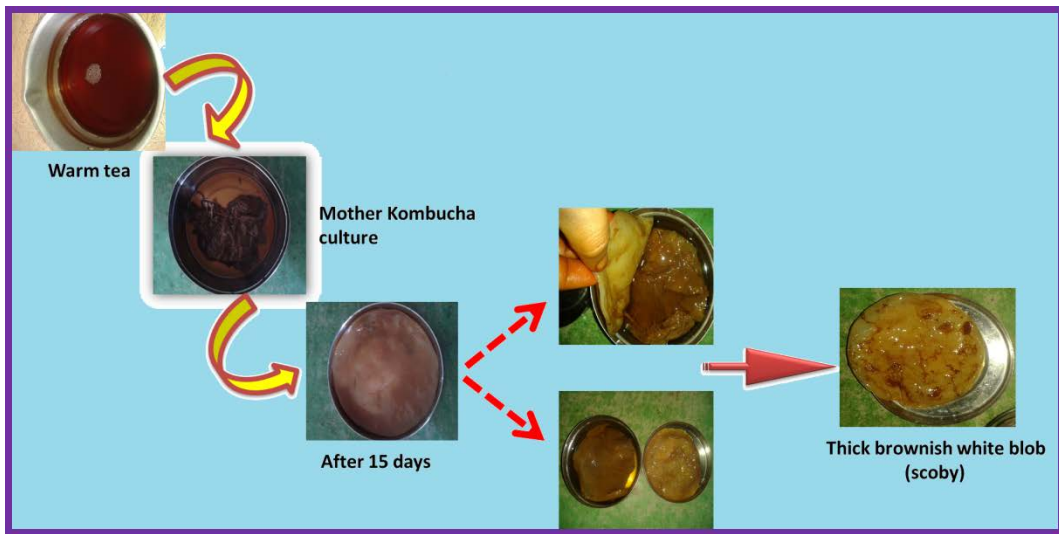
Fig. S1 Preparation of Kombucha scoby