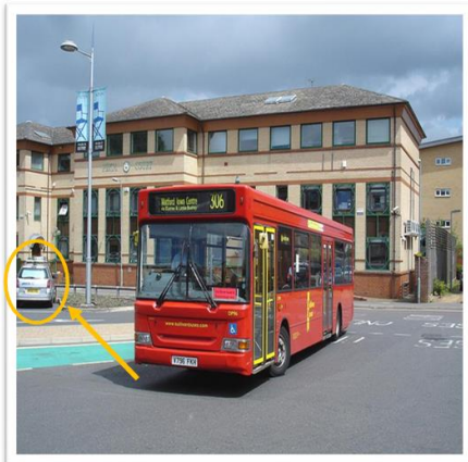
CAP: person, car , bus Ours: person, car, bus