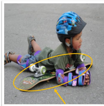
CAP: person, skateboard Ours: person, skateboard