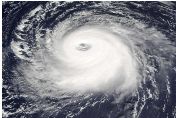
Tropical Cyclone Cloud Graph