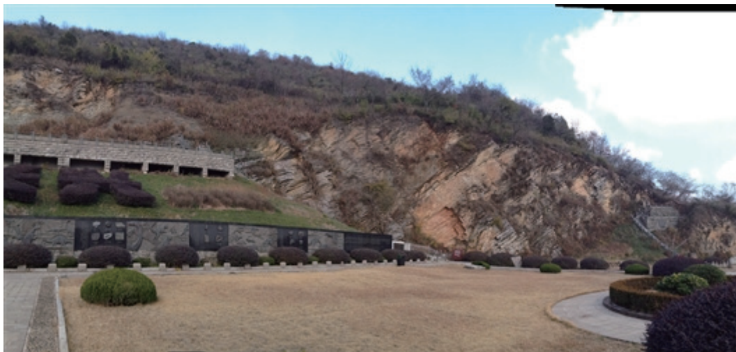
Fig. 2. Permian-Triassic great extinction and GSSPs of Meishan, Zhejiang Province.