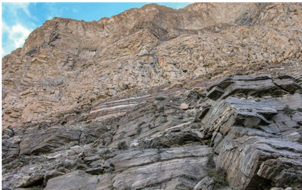
Fig. 5. The South Tibetan detachment system in the Rongbuk Valley, Tibet.

Shilin Karst is a site of plateau karst, outstanding for the limestone pinnacles decorated with deep, sharp karren, which is the result of karst processes (Fig. 6). The limestone is