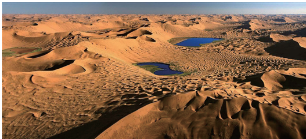
Fig. 7. Bilutu Megadunes and Lakes in the Badain Jaran Desert, Inner Mongolia (source: https://news.sciencenet.cn/htmlnews/2022/10/488289.shtm ).

Source: People's Daily, November 2, 2022, https://paper.people.com.cn/rmrb/html/2022-11/02/nbs.D110000renmrb_13.htm ; The First 100 IUGS Geological Heritage Sites Dossier, https://www.iugs.org/_files/ugd/f1fc07_af0231893ea04e61986d7aaf92cc085a.pdf?index=true .