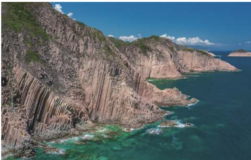
Fig. 4. Early Cretaceous rhyolitic columnar rock formation of Hong Kong.