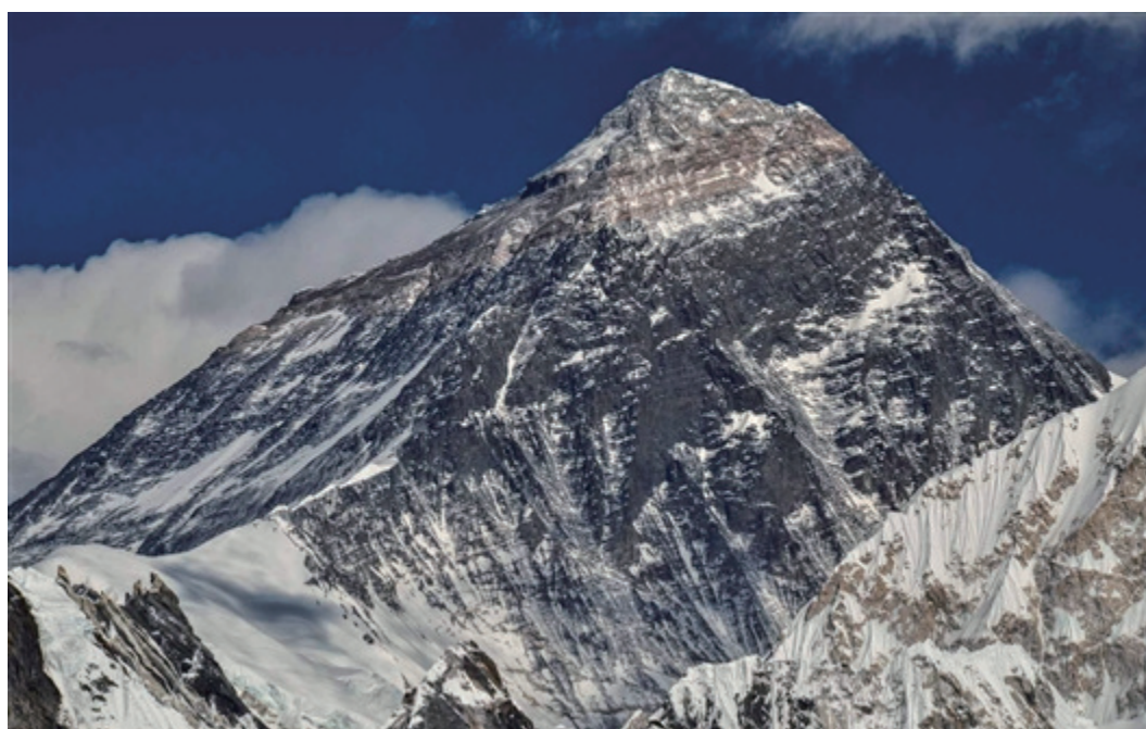
Fig. 1. Ordovician rocks of Mount Qomolangma, Tibet.

volcanic activity in the area about 140 Ma years ago (Fig. 4). The Columnar Rock Formation is widely exposed along the coast, cliffs and numerous islands in Sai Kung. The formation occurs as a wide-spread sheet of about 100 km 2 and up to 400 m in thickness in a giant caldera complex. The average column diameter is 1.2 m, with the largest specimens measuring 3m. Sai Kung is characterised by long meandering coastlines and numerous islands. This formation is integrated with diverse coastal erosion and deposition landforms, such as sea cliffs, sea notches, sea caves, sea arches, sandy and pebble