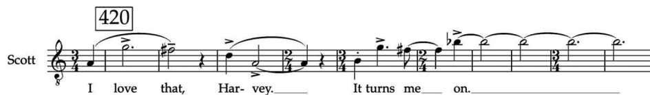
Figure 3. Scott's vocal line showing romantic upward leaps (Act One, Part Four) 20

Puar 30 argues that, in the United States, queerness is considered sexually exceptional through a rhetoric of sexual modernization, and that tolerance of a perverse "other" is granted by an imperialist, centralist position that enjoys sexual, racial, and gendered normality. The libretto includes a variety of ways in which othering is expressed. The character most frequently engaged in othering is Dan White, whose overt homophobia frames his role. Terms such as "Faggot!" and "Dyke" contextualize him as a villain. His concise vilification of queer individuals contrasts sharply with the relative celebratory nature of his targets. He is represented as a somewhat one-dimensional character, who seems incapable of uttering anything other than hate speech, with phrases such as "Shut up, faggots! Move it along."