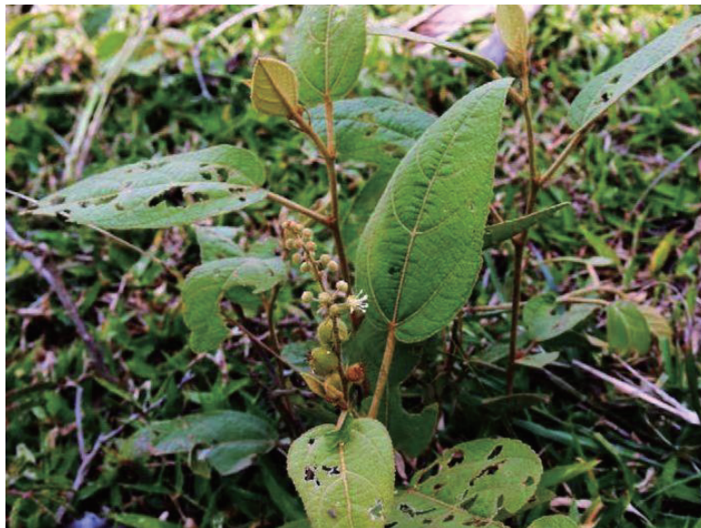
Fig. 1 The appearance of C. crassifolius

growing period, the hairs on the leaves gradually fall off, the rest hairs are rough at the base and turn black after drying. Basal efferent veins are 3 (-5), and lateral veins are (3-) 4-5 pairs. The petiole is 2-4 cm long. Two pedunculated goblet glands are on both sides of the midvein at the base of the leaf blade or the apex of petiole. Stipules are drillate, 2-3 mm long, caducous. Raceme is terminal, 5-10 cm long. Bracts are linear, 2-4 mm long, with linear teeth at the edge and small capitate glands at the tip. Male plants have sepals outside stellate villi, the petals oblong, as long as sepals, and the edges are woolly. There are 14-20 stamens. Female plants have sepals outside stellate villi, the ovary is densely yellow villous, and the style is 4 deeply lobed and linear. The fruit is subspherical, about 1 cm in diameter, and the seeds are oval and brown, about 5 mm long. It flowers from November to June of the following year. Produced in Fujian, Guangdong, Guangxi, Hainan and other places, it grows in coastal hills and mountains rather than on dry slopes [1]. It is also distributed in Vietnam, Laos and Thailand (Fig. 1) .