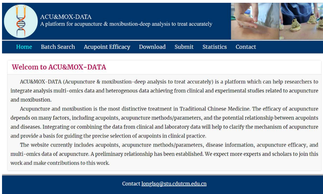
Figure 1. Home page of ACU&MOX-DATA website ( http://cbcb.cdutcm.edu.cn/ACU&MOX-DATA/ ).

Another important function of the ACU&MOX-DATA website is to help researchers develop new strategies for acupoint combination research. Previously, if researchers wanted to know why two or more acupoints were used together to achieve better therapeutic effects, they would have to study each acupoint individually, and then combine them according to their common targets or pathways. This research strategy is more likely to verify the existing law of the acupoint combination use rather than create a new method for finding new combination mode of synergistic acupoints in treating disease. Therefore, it is difficult to break through the already existing acupoint combination of experience and theories. However, if we use a platform such as ACU&MOX-DATA, the research strategy will be transformed toward identifying the core mechanism or core symptom of the disease, finding the acupoint group that can affect the core mechanisms or core symptoms through network backtracking, and then optimizing the acupoint group through certain screening processes, so that the acupoint combination formula can be obtained. Thus, it is relatively easy to find the rule of acupoint synergistic effect, which can be verified later in clinical practice. It is undoubtedly very useful for promoting the development of acupoint combination use (Figure 3).