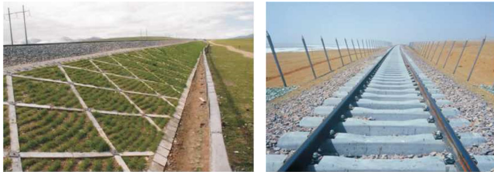
Fig. 2 Sub-grade with thermal conductive rods.