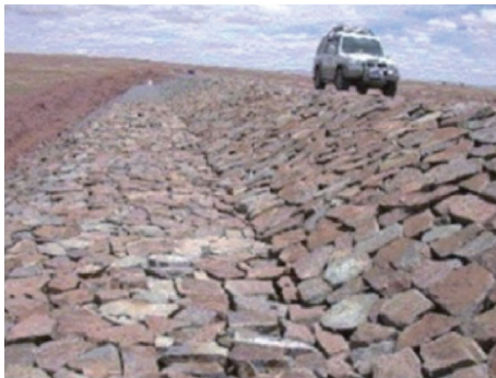
Fig. 3 Sub-grade with rubble slopes.

to that mentioned above. The thermal conductive rods belong to a system that uses two-phase conversion (gas–liquid) of the medium inside seamless steel tubes, relies on the temperature difference between the buried part (condenser) and the part exposed to the atmosphere