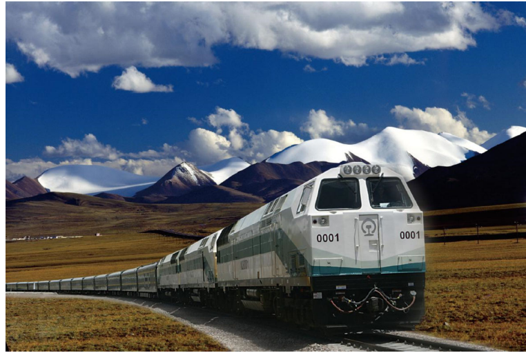
Fig. 1 Qinghai–Tibet Railway.