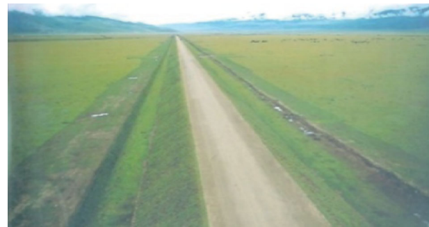
Fig. 5 Completed sub-grade at the south foot of Tanggula Mountains (green corridor).

To ensure the safety and health of construction personnel, the construction of the railway adopted the idea of humanism, adhered to the policy of “putting safety first and giving priority to prevention”, and established a complete health guarantee system and a perfect epidemic prevention mechanism. Medical examination-based